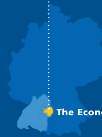
The Economic Region Ostwuerttemberg